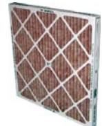
Available in UL Class One for locations having this building code requirement. Request Product Sheet 1002CL1.