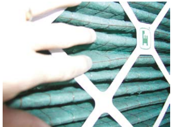
Back of 30/30 after six months