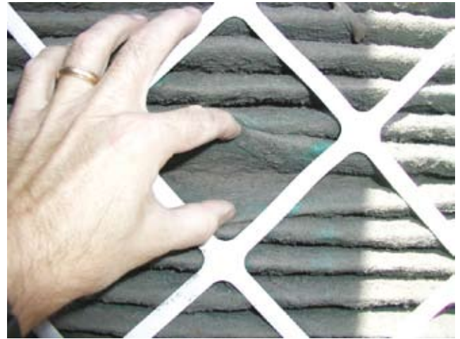
Front of 30/30 after six months