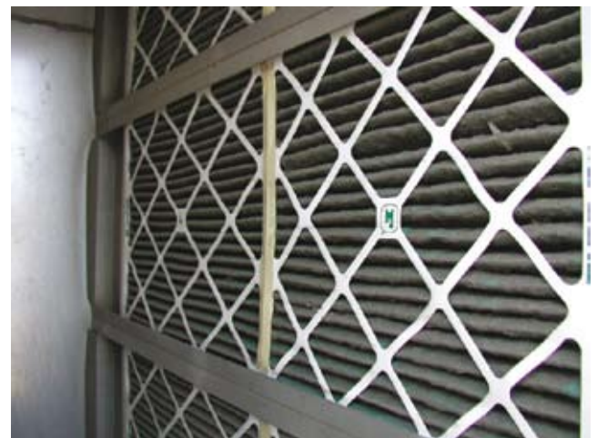
30/30 maintains structural integrity after six months

The 30/30 maintained lowest resistance to airflow. The Camfil Farr 30/30 filter met the rated efficiency and maintained structural integrity throughout the six months of service life. The resistance to airflow was just over the suggested final resistance of .80"wg. Neither of the two opposing filters held up under testing, indicating the life cycle would be shorter than three months.